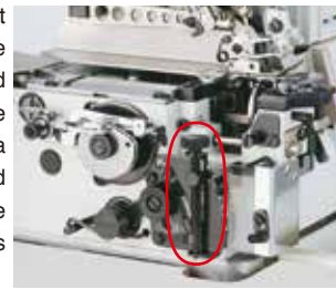
Differential-feed micro-adjustment mechanism

The differential-feed micro-adjustment mechanism, external increasing of the differential feed ratio and the main feed dog height can all be adjustable on the front face of the sewing machine with a screwdriver. The machine is provided as standard with functions which enable easy and best-suited adjustments according to the material to be used.