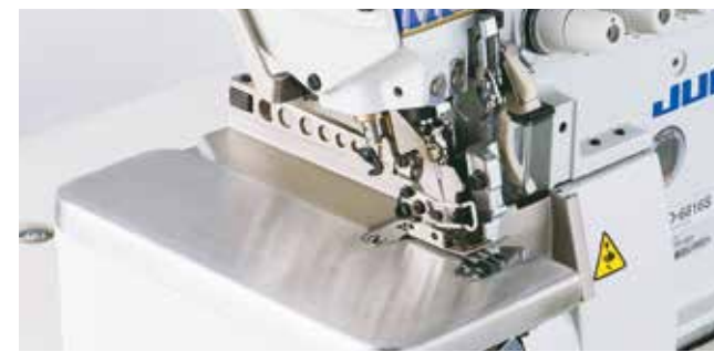
For runstitch / MO-6816S-FF6-30H