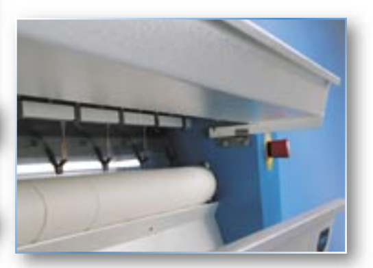
Two take-down trays for linen at feeling and exit

The GAS BURNER jet line is extended to drum full length to guarantee heating spread-out; it also carries all CE safety devices. Damp and gases are exhausted on the opposite side where motors and gas valve are located; the exhaust ensured by two powerful motor-fans must be connected to an outside chimney.